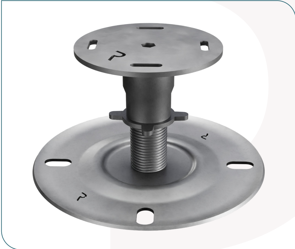
Preventa Metal Adjustable Pedestals